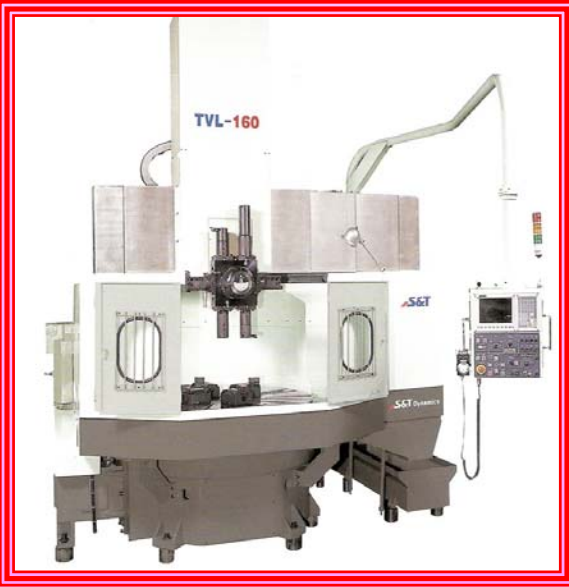
CNC VTL 80" DIAMETER

Introducing... AMT'S 84th CNC LARGE PART TURNING! Recently added 80" CNC VTL S & T Dynamics TVL-160 This increases our CNC turning capacity to 80.7" dia x 35.4" height.